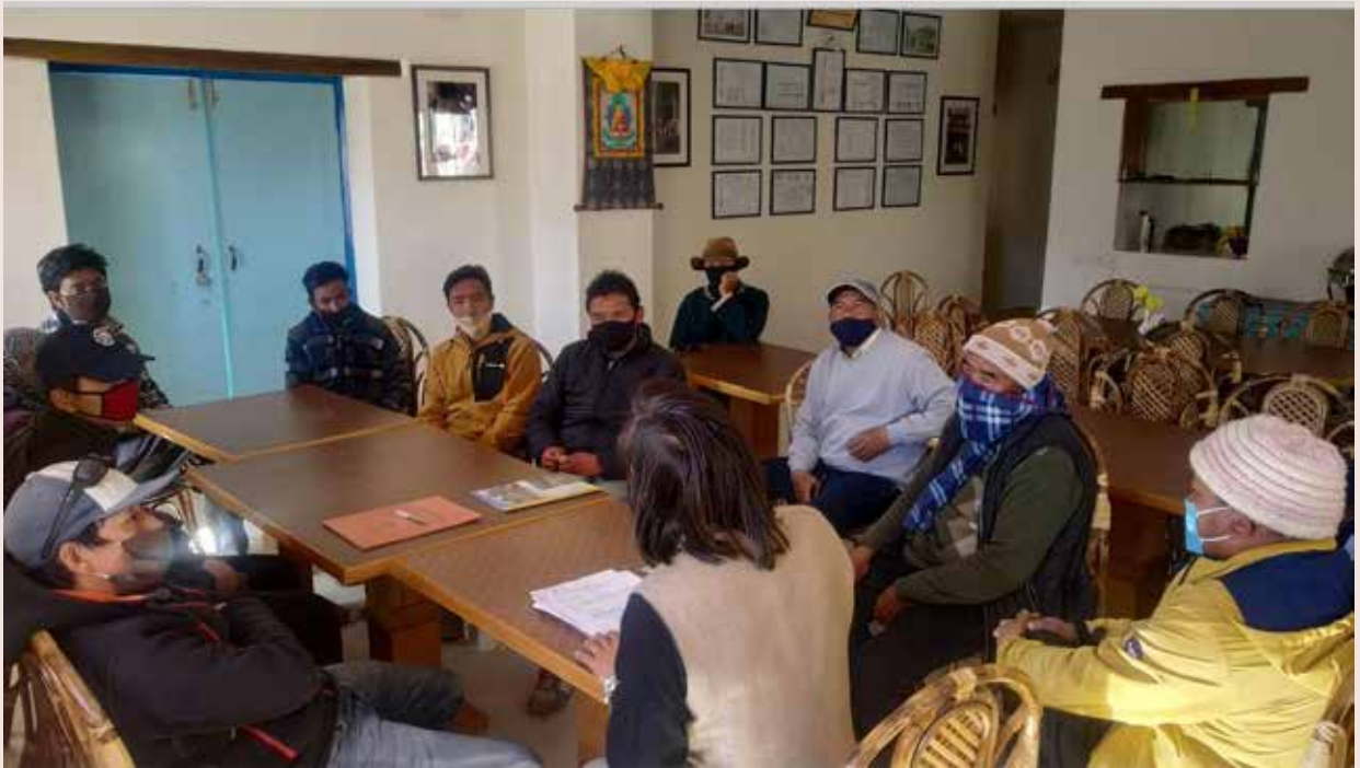
Spiti Projects Society holding a Meeting in the Community Centre