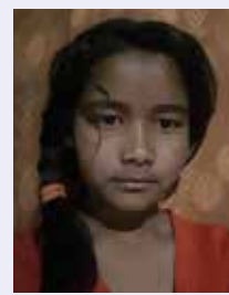
Dolma, Hull Village