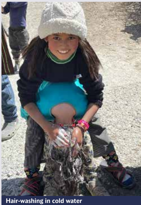
Hair-washing in cold water