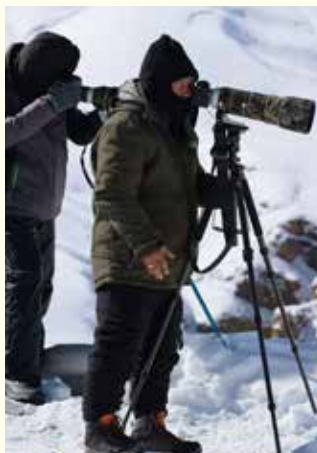
The snow leopard is a major attraction for tourists