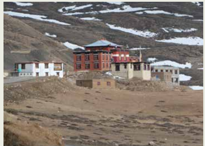
2022 February: No snow melt to provided water for crops