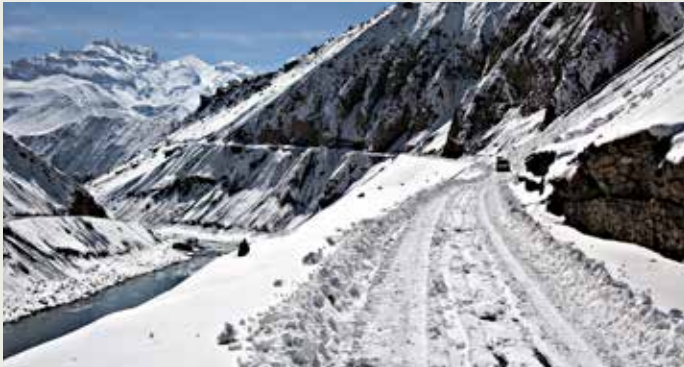
2018 March: Mountain roads are covered in snow

shorter winters will have a significant effect on the ability of the valley's farmers to produce the sort of crop yields that they need to exist.