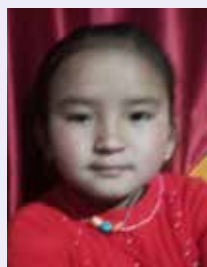
Tanzin, Lalhug Village