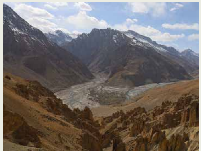
2022 April: Practically all the snow has disappeared