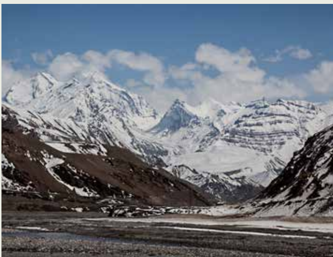
2012 April: The distant mountains are topped with snow