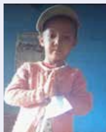
Kunzang, Key Village