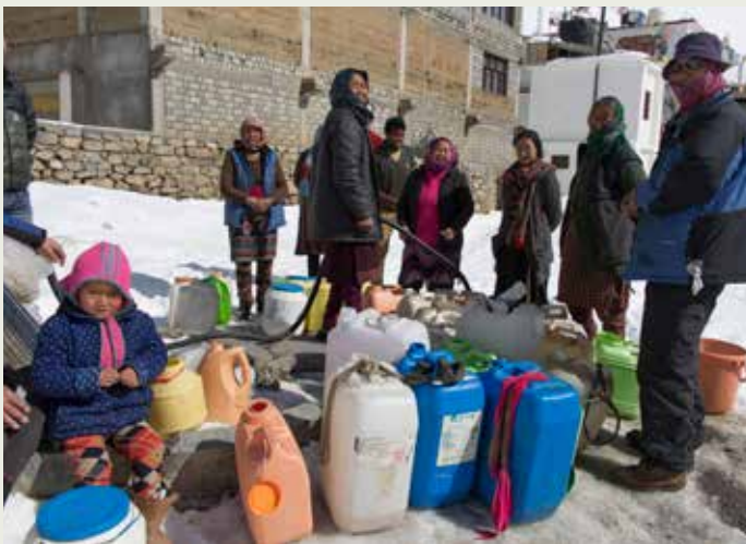
2019 February: Collecting water in February