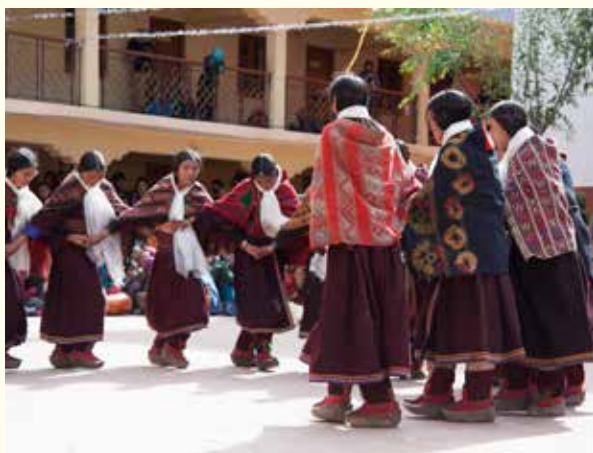
Tourism has been a great gain for local people