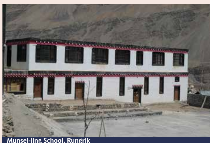
Munsel-ling School, Rungrik

Now that schools have re-opened in the valley after the Covid pandemic, we have been advised that many children need additional help to catch up on their studies, given the amount of time lost when schools were closed. Our plan for this year is to increase the support for children whose parents do not have land and live at a subsistence level, to give the child an opportunity for a better life. They