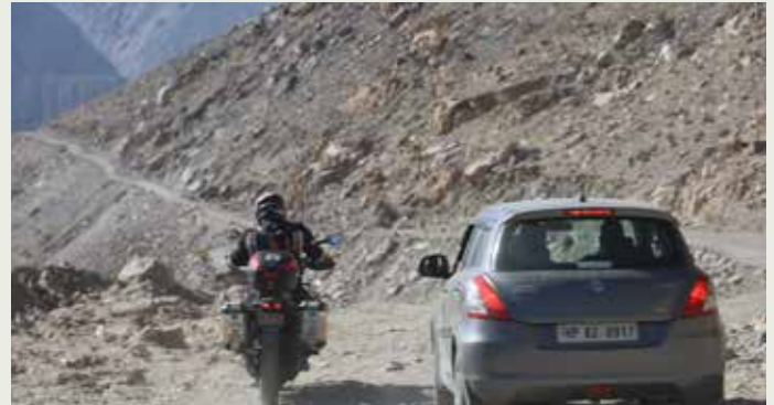
2022 March: The roads are totally clear of snow