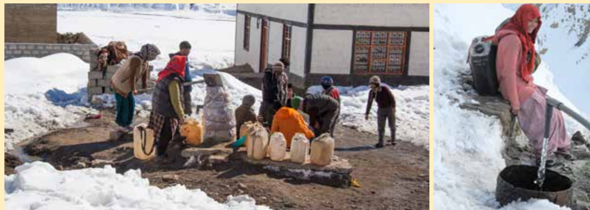
Collecting water in Winter

The valley has sub zero temperatures for 6 months in winter, all water for households and the animals has to be collected from deep natural springs.