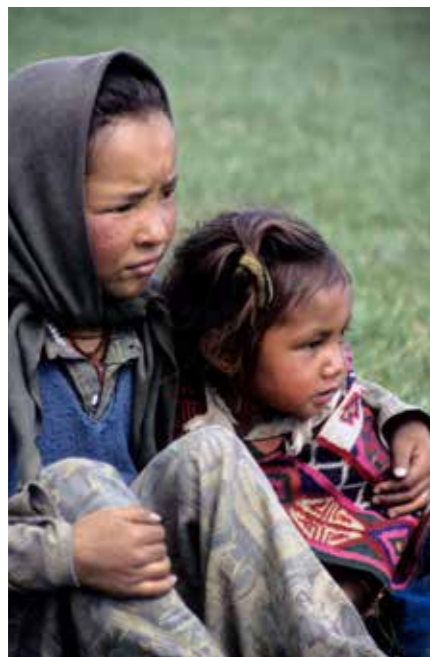
Below right: A family rests in the evening after a hard days work clearing the pea fields.

The Spiti Valley lies in a remote area high in the Himalayas on the Tibetan plateau and was until the 19th century part of Tibet. The valley is snow covered for 6 months of the year and temperatures can drop to - 40C in the winter. In the summer there is little rain. For the 10,000 inhabitants life is harsh and physically demanding at an altitude of 12,000ft. It is hard to make a living by farming on barren land and life is lived at subsistence level. Spiti is still essentially a Tibetan medieval culture trying to come to terms with the 21st century. The community is warm hearted and generous by nature, with