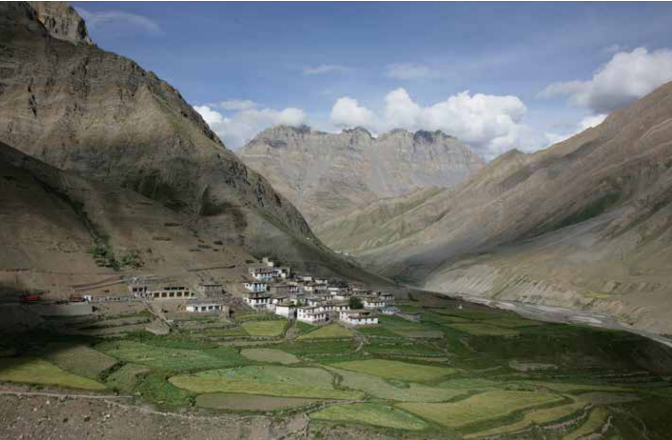
Above: A typical village in the Spiti, Demel nestles at the foot of the xxx mountains and is known as the weaving village.