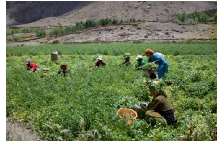
Left: Peas are the main cash crop that the villager farmers harvest in July. It is sold on to merchants from Delhi and essential for the villages' survival.

During the Sino-India border conflict in 1960, the area was closed, and used as a buffer zone until 1992 when it reopened to foreign visitors. Doctors visiting the area found the average state of health to be very poor. 30% of the children were losing their hearing through untreated ear infections, and there was a high incidence of stomach cancer arising through poor diet. There was high infant mortality and life expectancy was about 50 years.