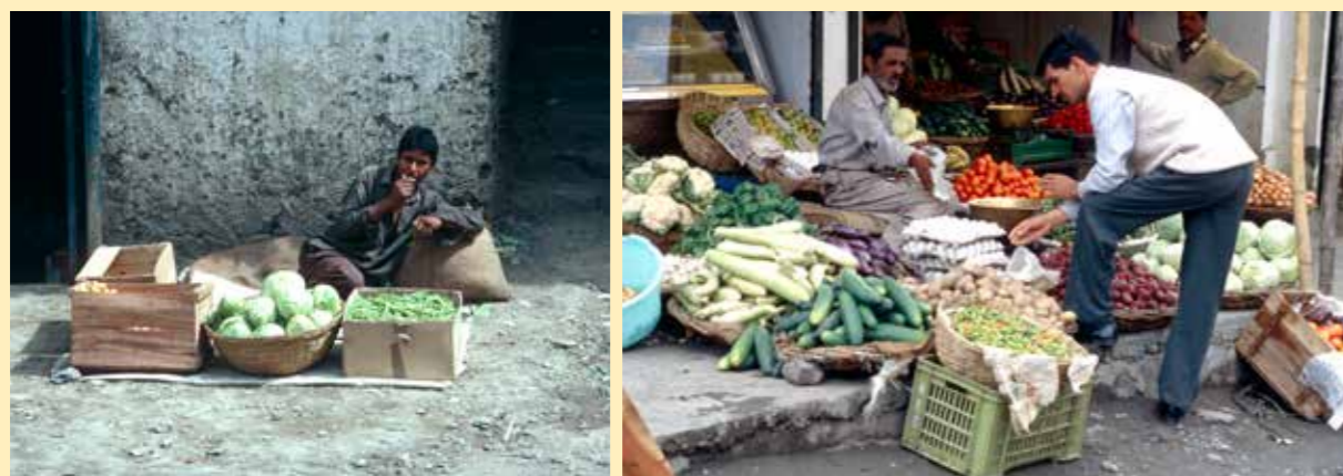
The Food Market

The valley has sub zero temperatures for 6 months in winter, all water for households and the animals has to be collected from deep natural springs.