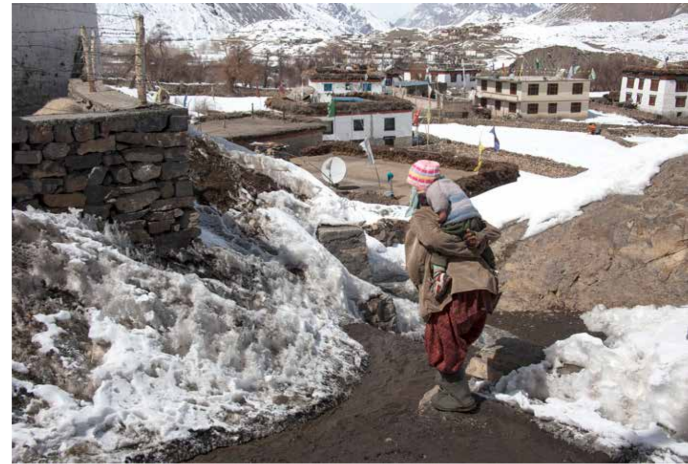
Below: Winters in Spiti last for six months with temperatures dropping to below minus 35 degrees. It is a time for visiting neighbours, celebrating festivals, birthdays and weddings.